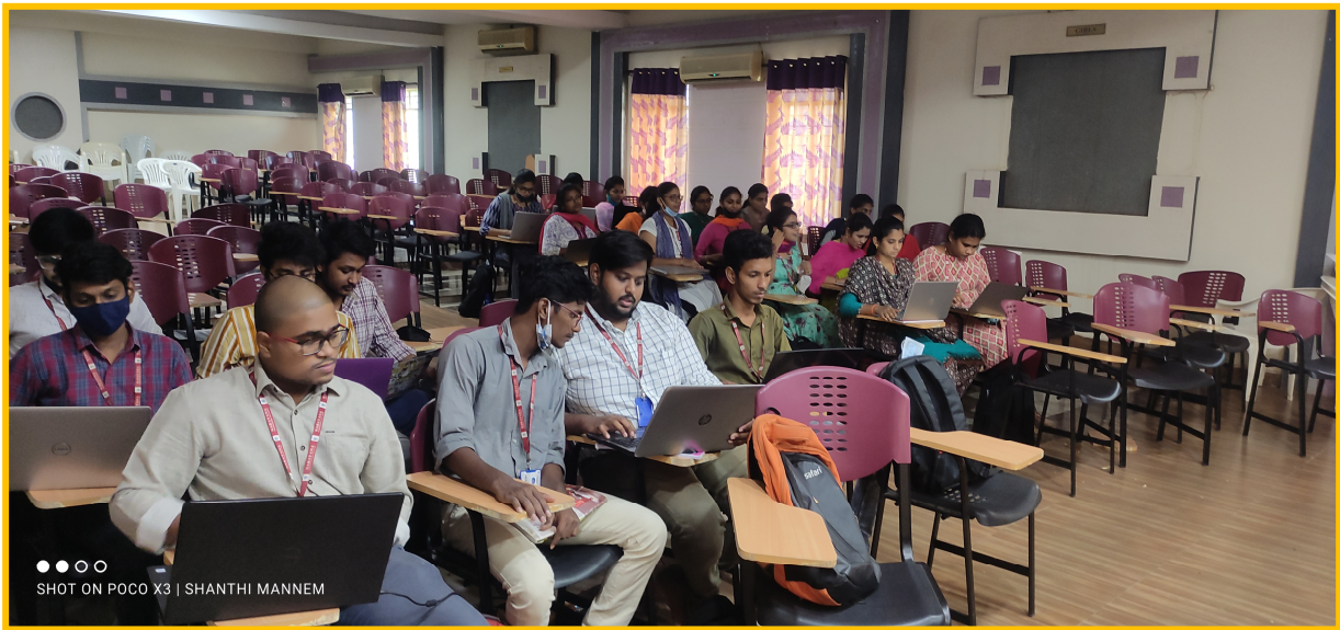
Students practicing JAVA program

At the end of the course the students were expertise in Aptitude, Group Discussion process and interview Process which will be very helpful in Campus Placements.